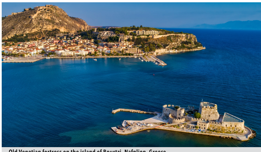
Old Venetian fortress on the island of Bourtzi, Nafplion, Greece