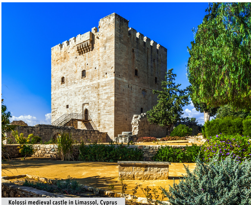
Kolossi medieval castle in Limassol, Cyprus