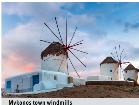
Mykonos town windmills