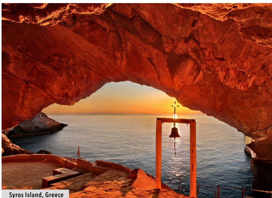
Syros Island, Greece