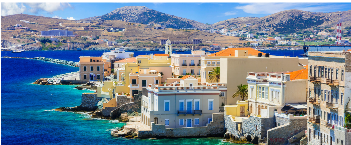
Heraklion harbour with old Venetian Fort Koule, Crete, Greece

Silversea is delighted to announce its return to service this summer . Be among the first to enjoy our new voyages on one of the most spacious ships in our fleet. Sail the beautiful Greek islands on bespoke itineraries that offer the best of a region, aboard our newest flagship Silver Moon . Plus, with two alternative sailing routes, each visiting different destinations, you have the option to combine voyages for extended exploration. From sun kissed beaches to UNESCO World Heritage Sites, we have conceived this collection of cruises with all safety measures in mind. Get back to the discovering the authentic beauty of the world in unwavering confidence.