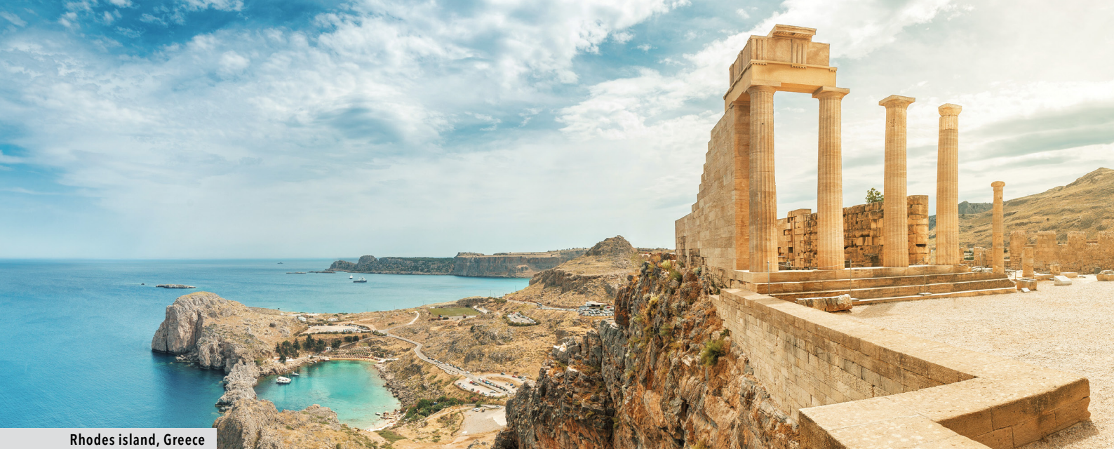
Rhodes island, Greece

Silversea is delighted to announce its return to service this summer . Be among the first to enjoy our new voyages on one of the most spacious ships in our fleet. Sail the beautiful Greek islands on bespoke itineraries that offer the best of a region, aboard our newest flagship Silver Moon . Plus, with two alternative sailing routes, each visiting different destinations, you have the option to combine voyages for extended exploration. From sun kissed beaches to UNESCO World Heritage Sites, we have conceived this collection of cruises with all safety measures in mind. Get back to the discovering the authentic beauty of the world in unwavering confidence.